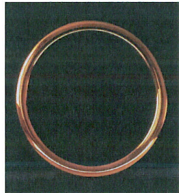
Byars, James Lee- The Halo

In the late 1960s poet Ishmael Reed adopted the 19 th -century term “HooDoo” — referring to religious and cultural practices originating in pre-colonial West Africa — to discuss uses of ritualism in more contemporary works of literature and art. “Neo-HooDoo,” he states in his 1972 collection of poetry, Conjure , “believes that every man is an artist and every artist a priest.” Reed looked to artistic expression as a pathway to explore cultural and political ideas beyond the confines of dominant belief systems and social norms. In his novel Mumbo Jumbo , for example, Reed incorporates innumerable, often conflicting cultural references into an